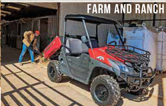
FARM AND RANCH